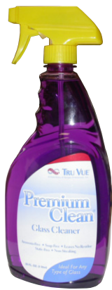
#987 26 oz. spray