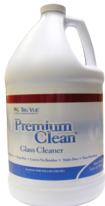
#988 1 gallon refill