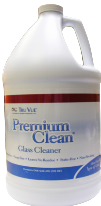
#988 1 gallon refill