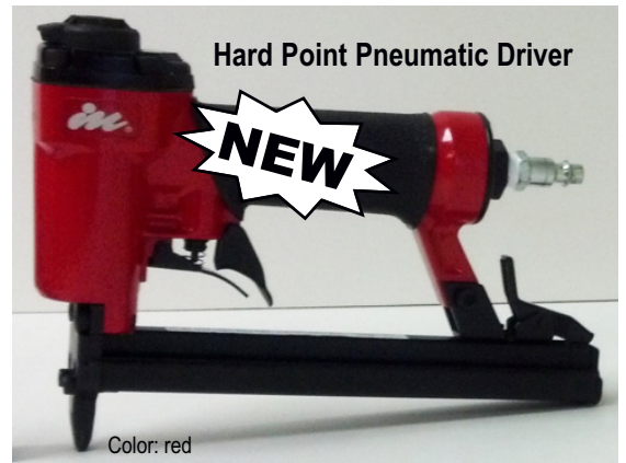
Hard Point Pneumatic Driver

Additional pneumatic drivers on page 53.