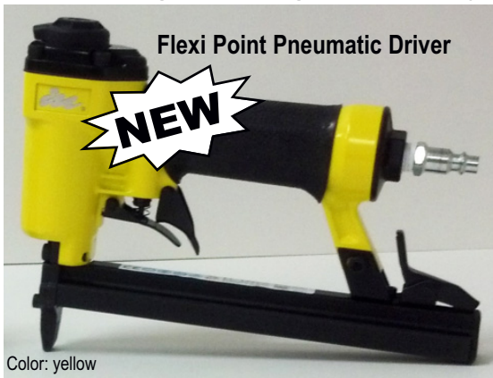
Flexi Point Pneumatic Driver

Designed for high productivity of point insertion into frame backs and photo frames