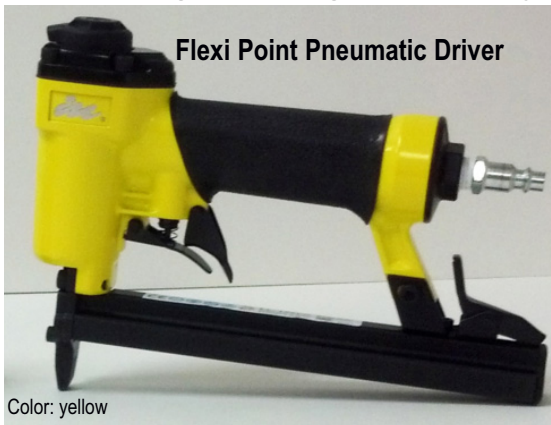
Flexi Point Pneumatic Driver

Designed for high productivity of point insertion into frame backs and photo frames