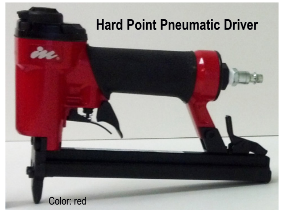
Hard Point Pneumatic Driver

Additional pneumatic drivers on page 63.