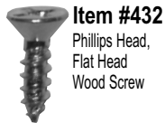
Item #432 Phillips Head, Flat Head Wood Screw

inner leg facing down, is mounted to the frame. They interlock easily and quickly and insure a strong, secure hanging system.