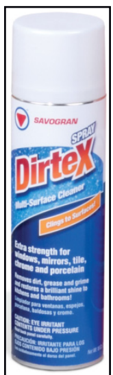
Item # Desc. 1 for 12 + 24+ 310 18oz. can 296 22oz. spray