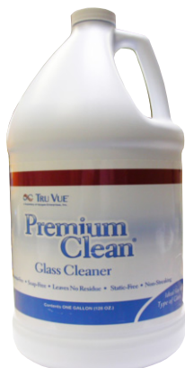
#988 1 gallon refill