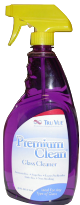
#987 26 oz. spray