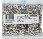
Metal Sleeves • First time user: