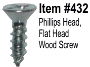
Item #432 Phillips Head, Flat Head Wood Screw

inner leg facing down, is mounted to the frame. They interlock easily and quickly and insure a strong, secure hanging system.