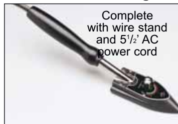
Complete with wire stand and 5 1/2' AC power cord

Designed for easy, professional-quality heating and tacking needs. Dial thermostat allows temps from 150°F to 410°F to be achieved. Glide easily over fabric or film surface due to the 100% coated shoe. The professionally designed shoe with its rounded sides and toe allows