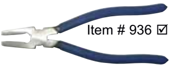
Item # 936