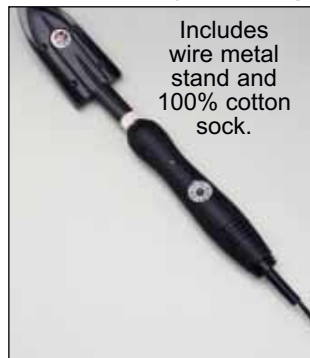
Includes wire metal stand and 100% cotton sock.

Precise, electronic temperature control makes the 21st Century Tacking Iron the one to consider when critical temperature maintenance is necessary. The built-in solid-state temperature control keeps the shoe temperature within 3°F of the dial. The dial is located on the cool handle, not the hot iron itself, so you won't burn your fingers. This unit heats up quickly and accurately. Temperatures range from 150°F to over 420°F. With curved sides