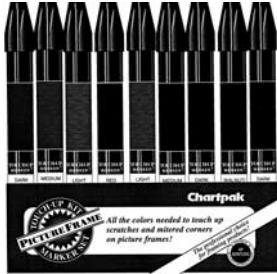
#518 Set of 9 Markers contains * items

The Chartpak Picture Frame Touch-up Kit is available as a 9 color set in a handy reusable vinyl pouch, or a set of 24 stored in our plastic marker caddy.