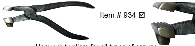
Item # 934 ☑