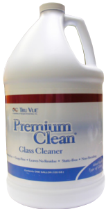
#988 1 gallon refill