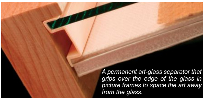
A permanent art-glass separator that grips over the edge of the glass in picture frames to space the art away from the glass.

FrameSpace® is made from a neutral pH plastic. It helps prevent mold growth, paper buckling, image transfer and adhesion to the glass. Removes easily to clean or replace the glass. The deeper shapes can be used to make any appropriate wood or metal frame into a shadowbox for framing objects.