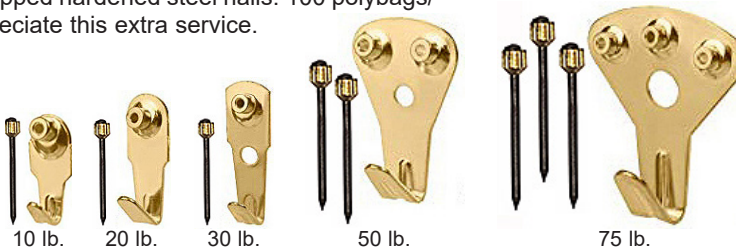
Bulk packed with brass capped hardened steel nails.

Note on Polybag: Thank You! Please accept this hanger as a token of our appreciation. It is the correct size for your hanging needs and is part of our continuing effort to provide quality and service.