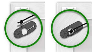
Attaching Quick Clip to frame