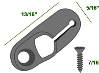
#1348 Quick Clip Jr. uses wire #1345