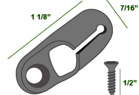
#1349 Quick Clip I uses wire #1346