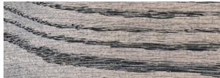
Example of Black Patinating Wax on Red Oak

Achieve a true, deep jet black finish or patina with this specialty wax. Ideal for antiquing frames that are bright and obtaining an aged finish on wood and metal frames. Ideal on raw wood with a hard grain, like oak. Suitable for use on wood, metal, gilt, plaster, MDF and papier-mâché.